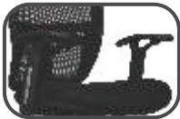
Choice of Fixed or Adjustable arms