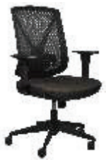
with 1D Arm