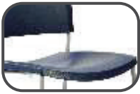
Attractive Design with easy-care plastic shell