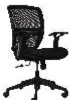
with Fixed Arm