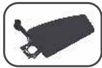
Foldable Writing Tablet with Cup Holder