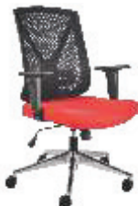
with polished aluminium base