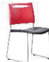
MANT-O (Dual colour)