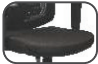
Seat with Moulded PU Foam