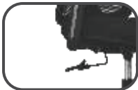
Pneumatic Seat Height Adjustment