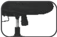
Synchronized Tilt Mechanism