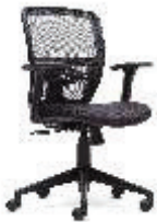
with 1D Arm