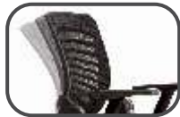
Dynamic Pivoting Back