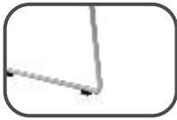
Sledge Base in silver color