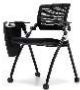
With Tablet & Castors