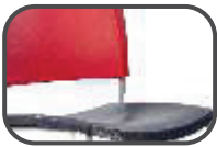
Dual tone colors back & seat in 2 different colors