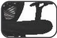
Special Fabric Seat with PU Foam