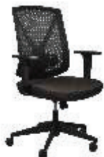
with 3D Arm