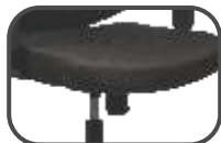
Synchronized Tilt Mechanism