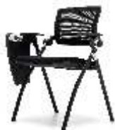
With Tablet & Glides