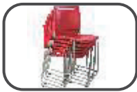
Easy to Store stackable upto 5-high